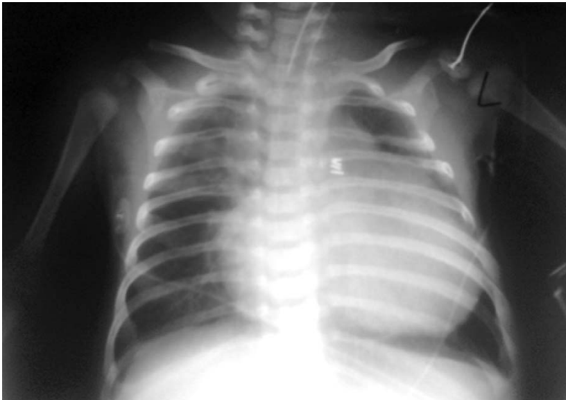
Figure 7. Chest x-ray of the infant who needed extra corporal membrane oxygenation support before transport.