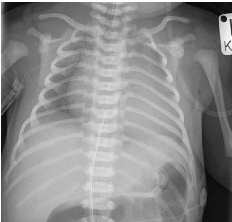
Figure 6. Chest x-ray of the infant on prostaglandin E1 infusion after admission to the intensive care unit.

of those who were treated with needle aspiration, 43% finally needed chest tube insertion, while only 10% in the expectant group. They concluded that a select group of infants on mechanical ventilation can be treated expectantly without initial chest tube placement. (7) The marked current practice variation exists among pulmonologists and thoracic surgeons treating spontaneous pneumothorax and bronchopleural fistula. This study showed that more than 50% of clinicians used a chest tube in mechanically ventilated acute respiratory distress syndrome, acute respiratory distress syndrome (ARDS) related tension pneumothorax in adults, while in small spontaneous pneumothorax were treated expectantly. (8) In blunt occult pneumothorax, Barrios et al. found that management without tube thoracotomy was adopted in 59 cases and was successful in 51 (86%). Observation was successful in 16 out of 20 occult pneumothoraxes (80%) exposed to positive pressure ventilation within 72 hours of admission. (9)