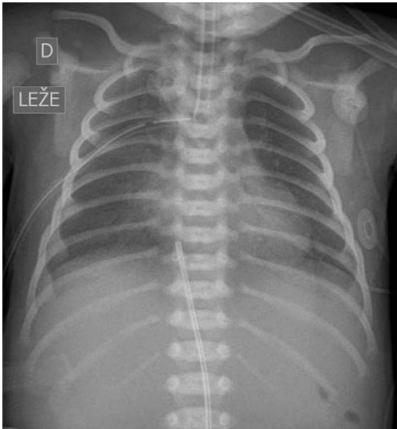
Figure 5. Chest x-ray after instillation of artificial surfactant.