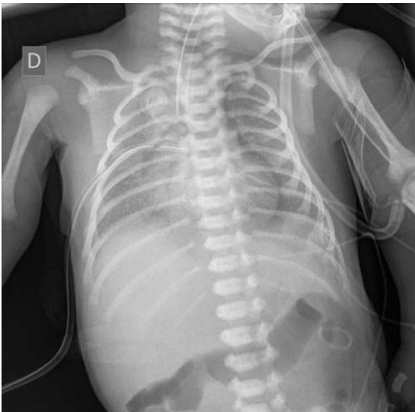
Figure 4. Chest x-ray after insertion of a chest tube in the right hemithorax.

of the chest tube. This question was important for the transport intensivist, because it is well known that firstly,