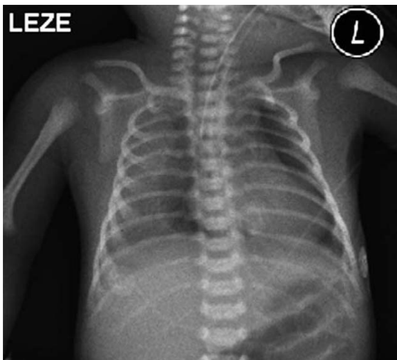
Figure 2. A chest x-ray of the same infant showing no deterioration 40 minutes later, before we left the regional maternity hospital.