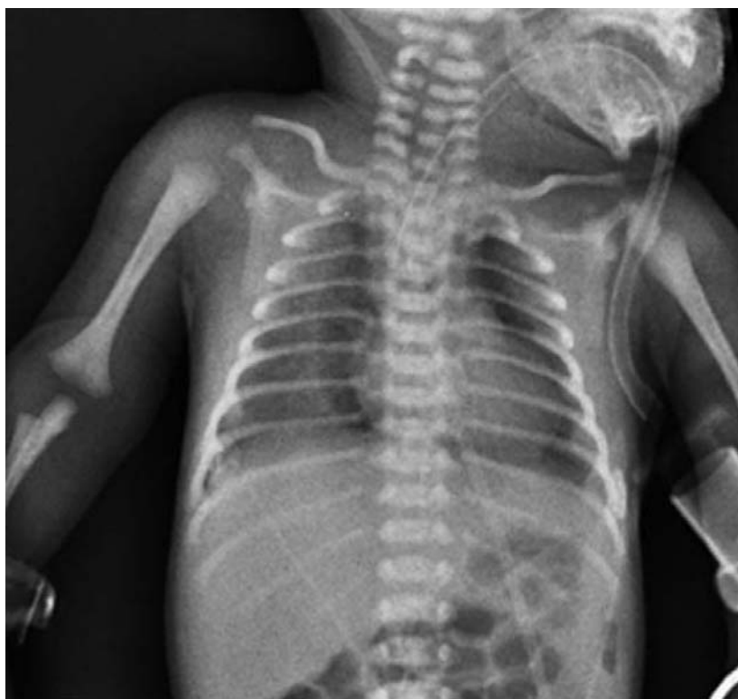
Figure 1. A chest x-ray with evident signs of hyaline membrane disease and pneumothorax on the right and left sides of the chest.

A lively discussion arose the next day during the bedside morning ward round regarding the necessity for pre- instead of post-transport placement